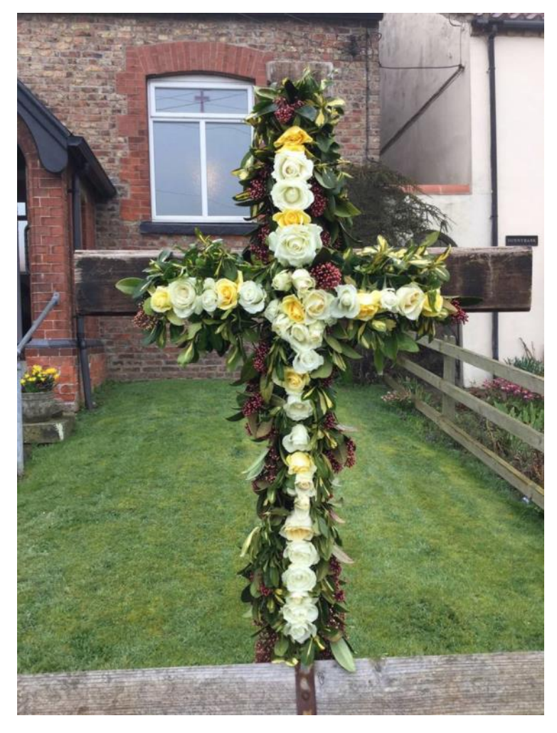
Easter cross at Thornton le Clay, April 2018