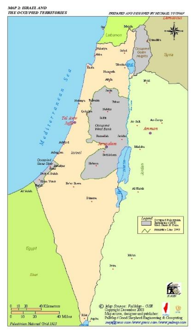
Occupied Palestinian Territories and Israel

back to the areas they were previously forced from