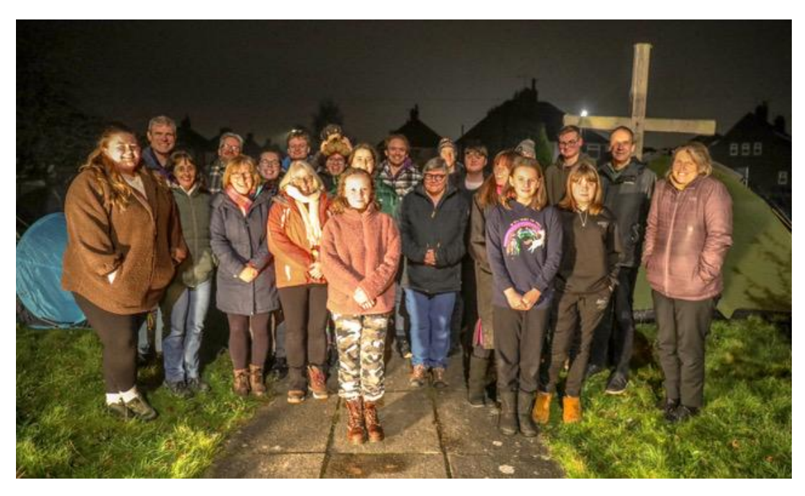
Those who took part in the Sleepout for Homelessness, January 2025

Please contact the Circuit Office if you would like to receive the weekly Circuit News email, or visit our website for information and other resources: <a href="www.yorkmethodist.org.uk">www.yorkmethodist.org.uk</a> or follow our Facebook page for news and updates: <a href="www.facebook.com/yorkmethodistcircuit/">www.facebook.com/yorkmethodistcircuit/</a>